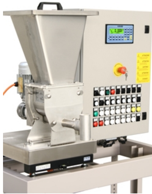
E-LW application example

E-LW: dosage and adjustment of the flow of material exiting from silos, tanks, hoppers.